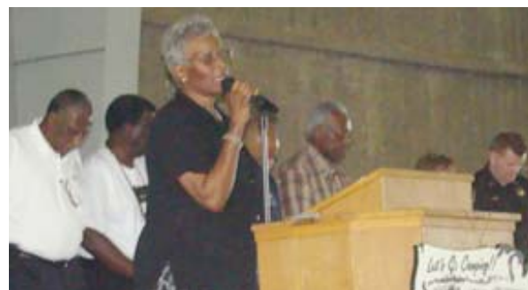
(Above) Guests participate in opening ceremonies.