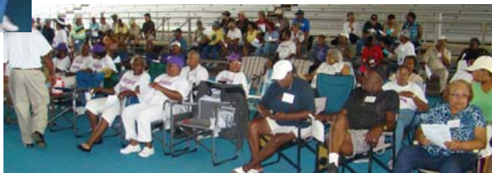
Members participate in singing during opening ceremonies.